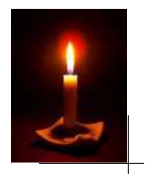
Focus the energy to move forward rather than blame the past